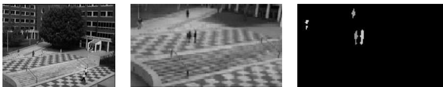
Figure 3: Typical Image from pedestrian plaza. Background mean image, input image with blob bounding boxes and blob segmentation image

The trajectories of each blob are computed and saved into a dynamic track memory . Each trajectory has associated a first order EKF that predicts the blob's position and velocity in the next frame. As before, the appearance of each blob is modeled by a Gaussian PDF in RGB color space, allowing us to handle occlusions.